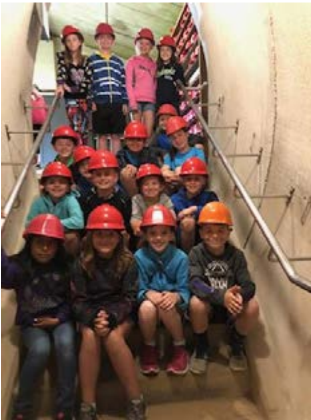
Fourth grade field trip to Platteville - touring the Mining/Rollo Jamison Museum and climbing the "Big M". The students enjoyed the trip. Thank you RRAP for sponsoring our field trip.