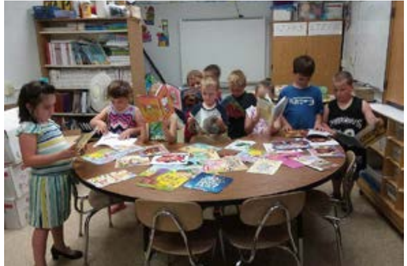
The 4K students are also choosing their book. Thank you to the local businesses that donate to this program.