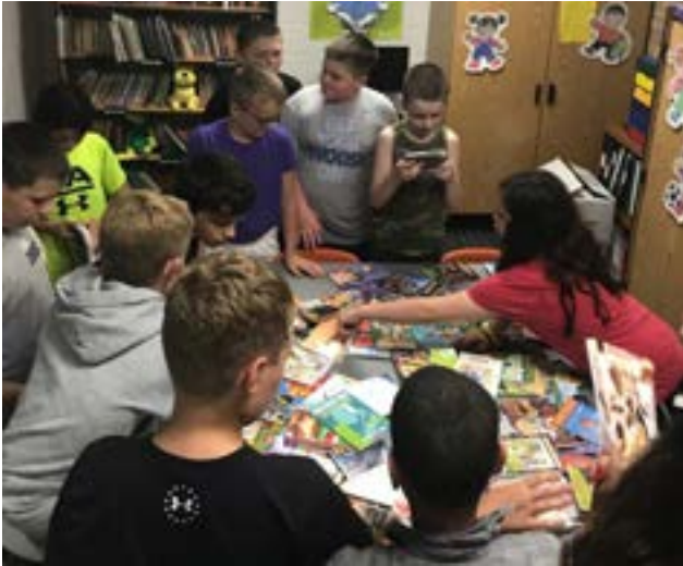
5th grade students receiving their book through the River Ridge Reading Wolf Pack Program.